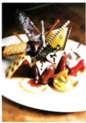
One of the post-meal indulgences (or meal substitutes) at The Chocolate Bar.

NORTH: Wolfdale’s in Tahoe City offers guests an eclectic range of entrees, including grilled elk chops, Asian-braised buffalo short ribs, Thai curry seafood stew, and mushroom ravioli. Top off any night at Northstar’s The Chocolate Bar, which has more than 20 concoctions on the dessert menu and to-die-for chocolate martinis.