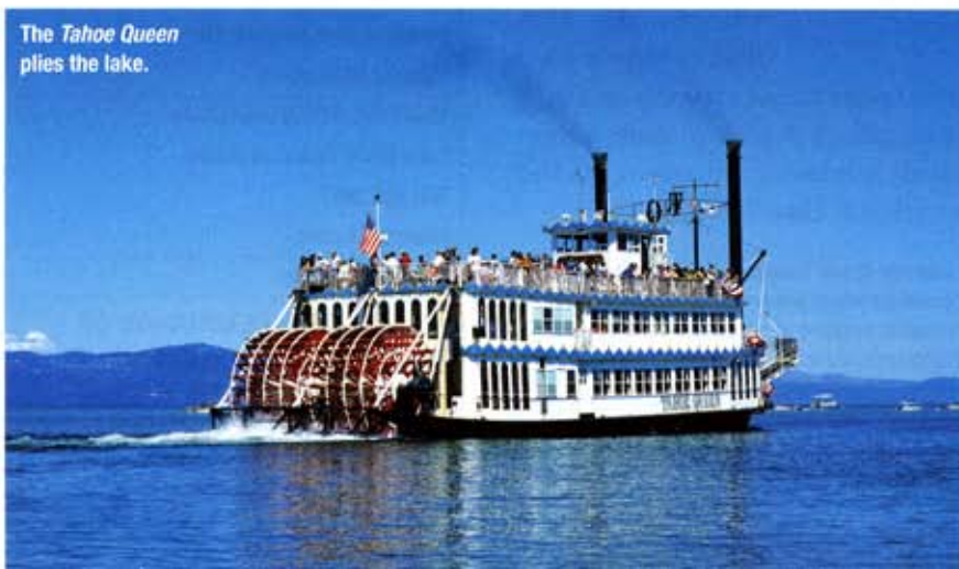
The Tahoe Queen plies the lake.

NORTH: Incline Village is known for both the Mountain Course, which was designed by Robert Trent Jones Jr., and is set amid countless pine trees with "no artificial landscaping," as well as the challenging Championship Course, designed by the senior Jones. Long hitters will have an advantage at the Championship Course, but be careful with that driver: Water hazards abound.