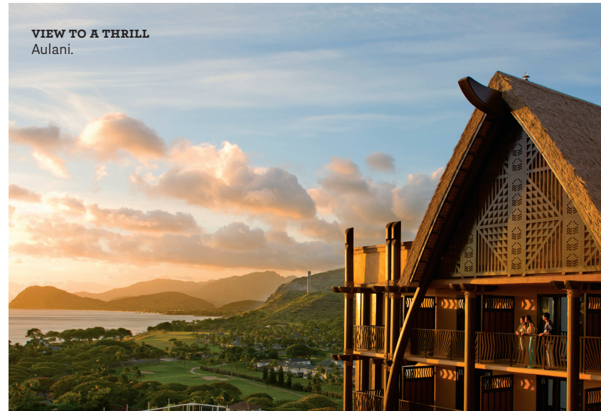
VIEW TO A THRILL Aulani.

Activities include two water slides, a lazy river, a zero-depth-entry pool, an