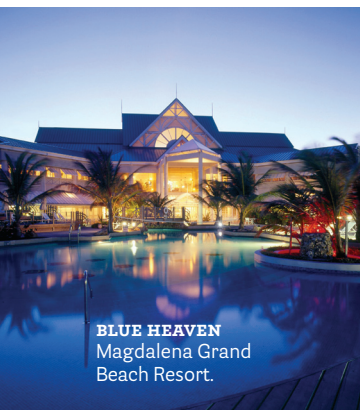
BLUE HEAVEN Magdalena Grand Beach Resort.

The Magdalena Grand Beach Resort opened in November as Tobago's newest resort in more than a decade. The 200-room oceanfront hotel features five dining options, an 18-hole golf course, expansive beachfront, and multiple swimming pools, including a free-form pool with cabana beds. All 200 guestrooms, ranging from doubles and kings to one- and